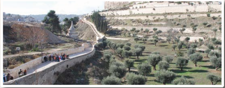
Walking through the Kidron Valley

exciting tour of Masada we will drive north along the shores of the Dead Sea to Ein Gedi, a green oasis in the middle of the desert, and see the area where David hid while fleeing from King Saul. Afterwards we will travel to Qumran to see the caves where the Dead Sea Scrolls were found. After lunch we will begin our ascent to Jerusalem. On the way, we will stop at Bethabara where John baptized those who came to him (John 1:28). This is also known as the "place of crossing" and is near the area where the children of Israel crossed into the Promised Land (Joshua 3:14-17). We then stop to view the St. George Monastery, an active monastery since the 5th century. We will also get a glimpse of "the Valley of the Shadow of Death". Upon arrival in Jerusalem, the capital of Israel for over 3000 years, we will stop on Mount Scopus where our guide will lead us in a traditional Jewish welcome which dates back to the time of Abraham. Dinner and overnight will be at our hotel in Jerusalem. (B/L/D)