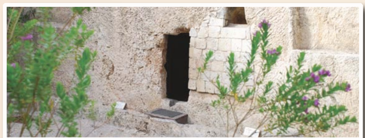
Garden Tomb - Jerusalem

After a great journey and unforgettable moments in the Holy Land, we will check out of our hotel and transfer to the airport in Tel Aviv for our return flight to the USA. We arrive back in the USA this evening with memories that will last a lifetime.