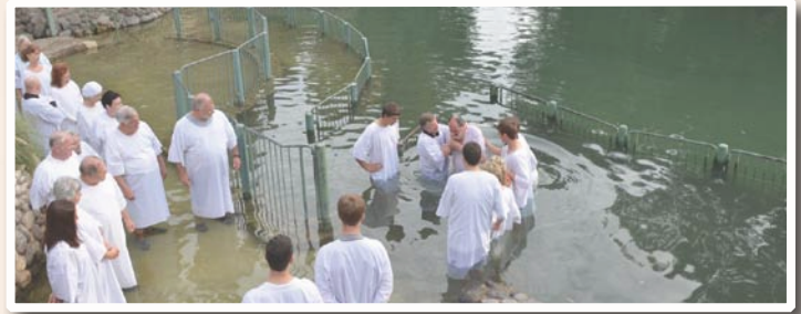
Jordan River Baptism