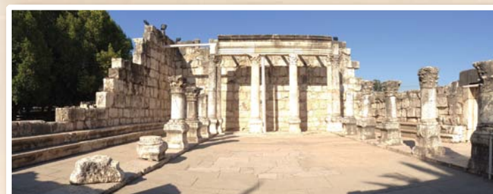
Capernaum - "The Town of Jesus"

After breakfast we start the day with a boat ride across the Sea of Galilee. While on the boat we'll pause for a brief worship service and remember the many miracles our Lord performed in this area. We'll dock at Nof Ginossar to visit the "Jesus Boat" museum to see a boat that dates back to the time of Jesus. Then we will stop at the Primacy of Peter where Jesus commanded Peter to "Feed my sheep". Then we'll proceed to Capernaum to see the remains of an early church, the ruins of Peter's house, and the ancient synagogue. After lunch we will ascend to the site of Banias where springs form a source of the Jordan River. Near here Peter made his great confession that Jesus Christ was Lord! From several vantage points today we can see Mount Herman in the distance. We will then stop in the Southern Golan for a scenic view of the Sea of Galilee. Then we'll gather on the Mount of Beatitudes by the Sea of Galilee to read the Sermon on the Mount while overlooking the Jordan Valley. On the return to our hotel in Tiberias we'll stop on the banks of the Jordan River for a baptismal service. (B/L/D)