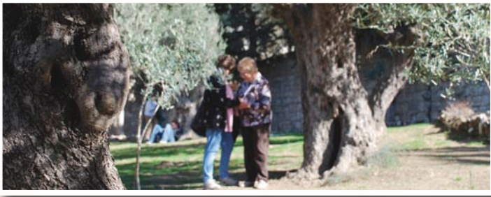
Praying in Gethsemane